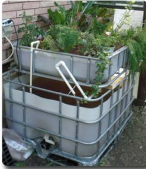
275-Gallon Tote turned into a backyard aquaponics system

Welcome the newest addition to our Home & Garden product line, Mosquito Dunks! These Dunks are a perfect companion to our Rain Barrels, providing safe biological mosquito control. Each dunk kills mosquito larvae for 30 days or more. Simply place one in your Rain Barrel. Mosquito Dunks are EPA registered in all 50 states and also made in the US. They are safe for pets, humans, fish, and wildlife.