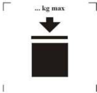
Stacking IBC Label