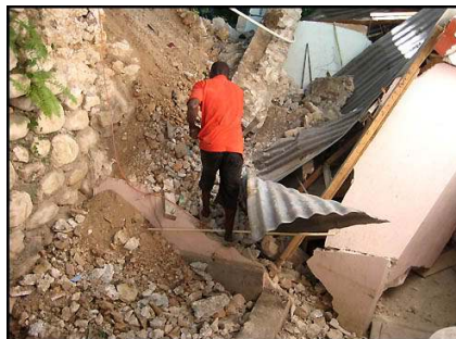
Devastation from the recent Earthquake