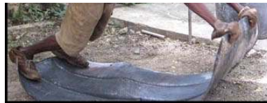
Flattening a steel drum

DOT will require every company that manufacturers, repairs or remanufactures an intermediate bulk container (IBC) used for hazardous material transportation to mark each unit with one of the two symbols shown below.