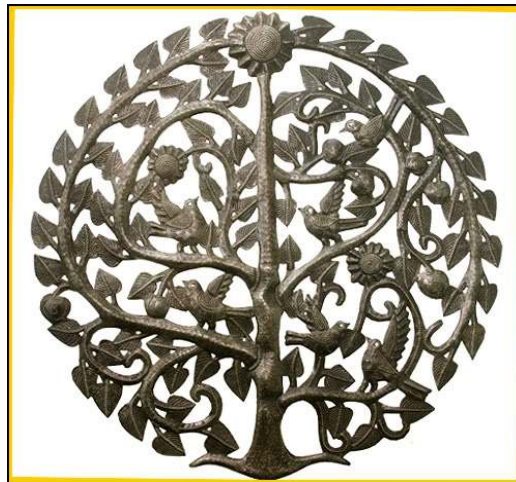
Haiti Metal Art - Tree of Life