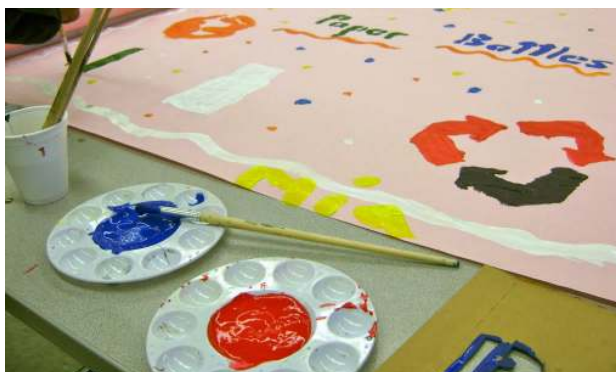
Students decorated the Fiber Drums