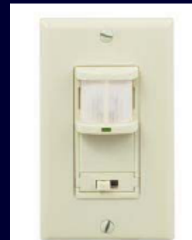
Passive Infrared Occupancy Sensor (replaces wall switch)