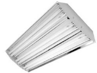
6-lamp Fluorescent High Bay Fixture