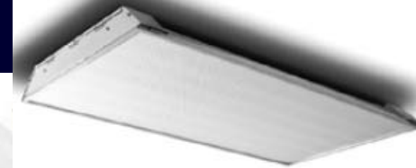
With Protective Polycarbonate Lens