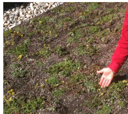
The Green Roof on Warren's Police Headquarters