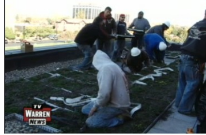
Proud Green Roof Students turned installers