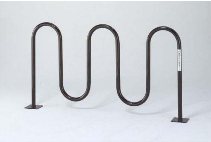
Wave 7 bike

Available in wide variety of colors to meet your styling needs