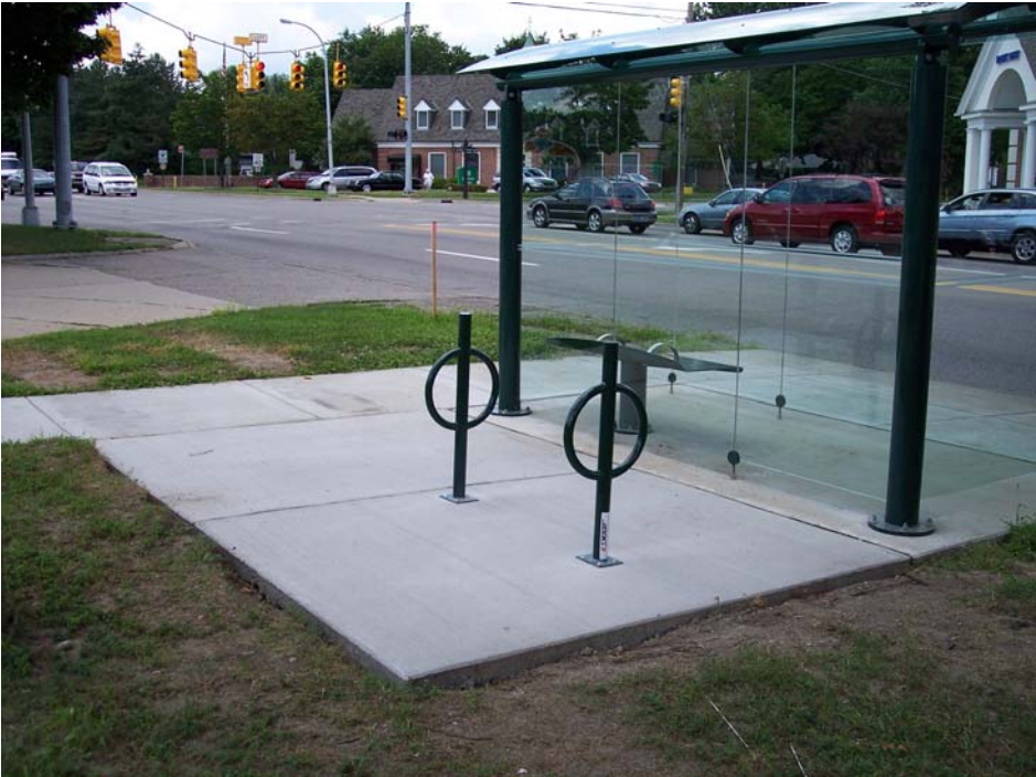
City of Birmingham's bike racks